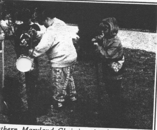
Students of the Southern Maryland Christian Academy and the Charles County Forestry Board planted 70 trees.

April was the month when students, faculty and the Charles County Forestry Board assembled to assemble the lines of trees at the Southern Maryland Christian Academy. The project was initiated by the Charles County Forestry Board as part of their School Forest Program. The Forestry Board is working with the Department of Natural Resources, Forestry Division in conjunction with this project.